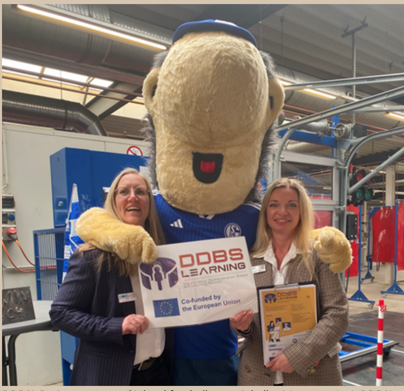
DDBSL Project manager (I.), local football team Schalke 04 mascot (m.), DDBSL team member (r.) from the German partners DVS.

On April 24, 2024, the SLV Bildungszentren Rhein-Ruhr in Gelsenkirchen welcomed over 500 visitors to an inspiring open day titled "Rethinking Education!", as a part of the Erasmus+ project presentation. The event featured insightful seminars and demonstrations focusing on remote learning and innovative welding techniques including the DDBSL method and virtual welding simulations. These presentations sparked broad interest and fostered exchange on cutting-edge educational approaches in welding technology training. We are immensely grateful to all the speakers, attendees, and behind-the-scenes organizers whose dedication made this event successful. We look forward to nurturing the connections made and exploring how these new opportunities evolve. Stay tuned for our future events, and once again, a heartfelt thank you to everyone involved!