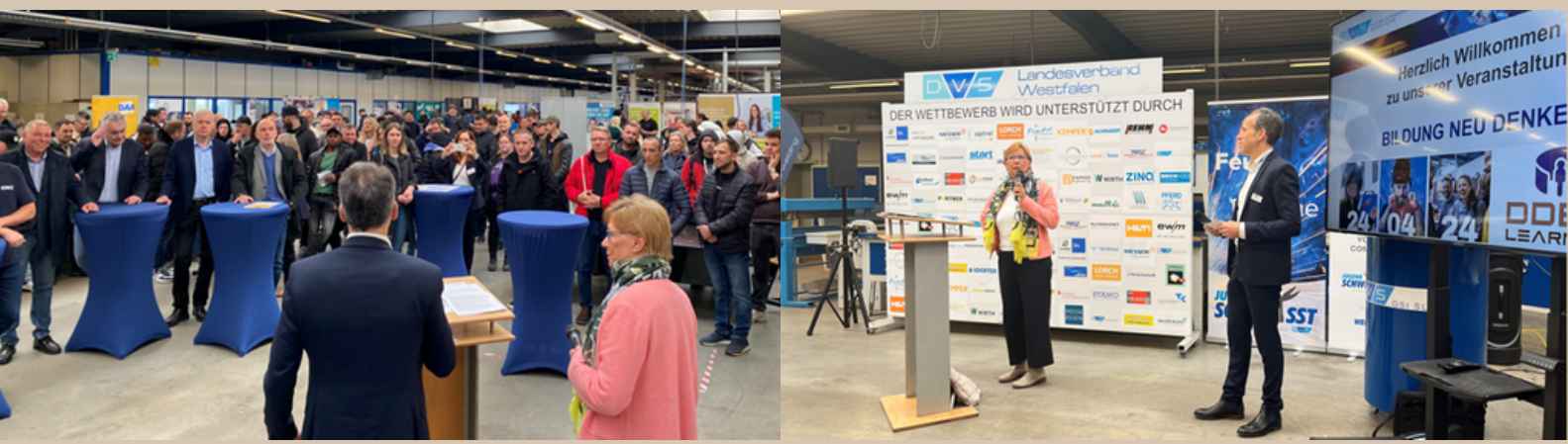
Opening Speakers, guest, and visitors at the Multiplier Event in Germany.

In Cyprus, Emphasys organised 4 different events, with a participation of over 60 participants. The profile of participants has included VET schools including VET provides, VET trainers and VET students, HEis including HE teachers and HE students, adult educators and other organisations related to the field of adult education. In Greece, TIHC has gathered 65 participants, and in Spain, INFODEF has reunited over 70 representatives from the adult education sector, as well as VET and policymakers from the local and regional governments.